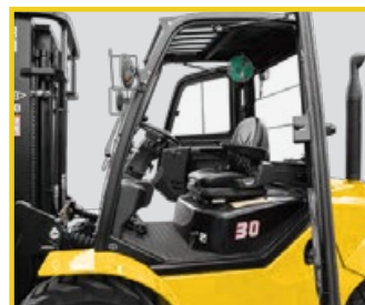
Large and spacious cab has left and right grab handles with wide openings for easy access