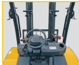
The newly designed steering wheel, braking system and easy to use levers provide complete operator handling control