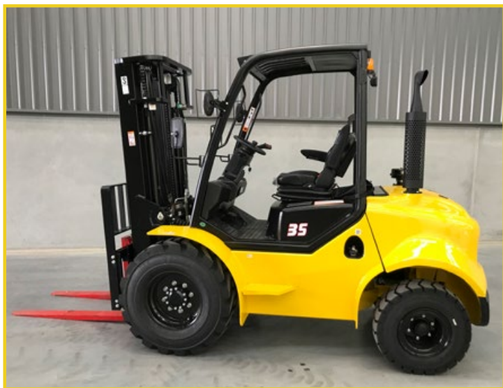
Quick easy to open hooks provide access to the engine compartment